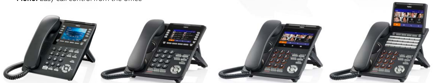
Colour: Easy call control from the office, remote or home-based working, hot-desking