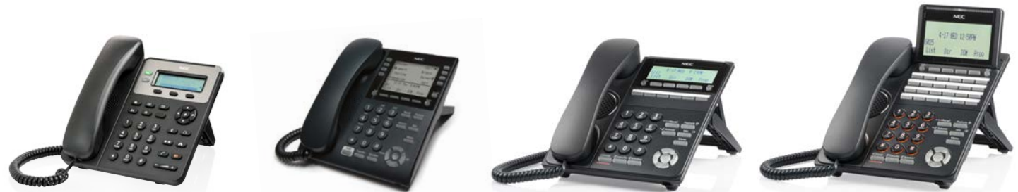
Mono: Easy call control from the office

For the full range of SV9100 handsets visit www.nec-enterprise.com for further details.