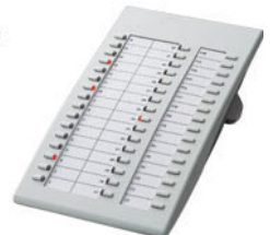
■ KX-T7740 DSS Console