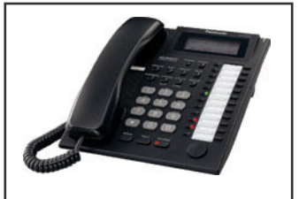
Units available in Black and White